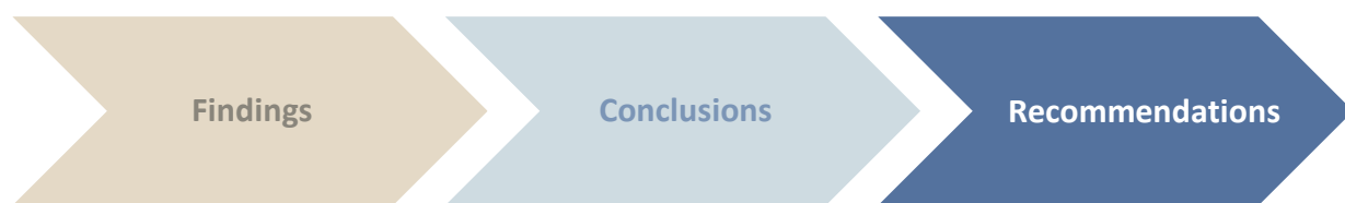
Figure 1. Findings, Conclusions, and Recommendations